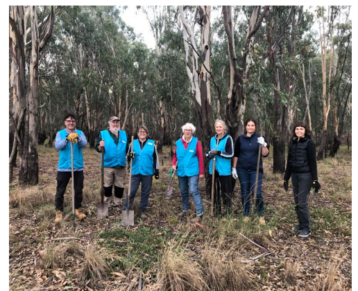
Figure 4. Shepparton Mooroopna Urban Landcare Group members ready on the tools for their weekly "Weeding the Bush" activity.