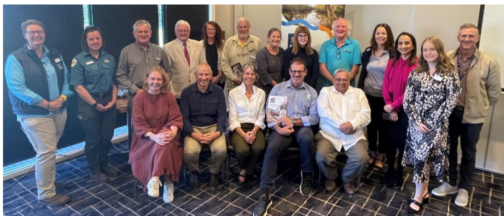
Figure 1. The RiverConnect Implementation Advisory Committee representatives celebrating the RiverConnect Strategic Plan Launch on 30 March 2023.