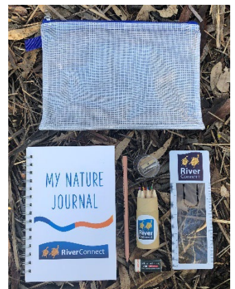
Figure 9. Nature Journal Kit prize.