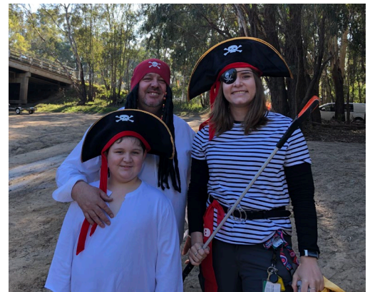
Figure 3. The "Pollution Pirates" cleaning up the Goulburn River.