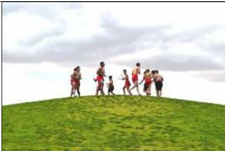
Image 6: Traditional Dance students from Shepparton High and Mooroopna SC on the grassy knoll at Victoria Park Lake.