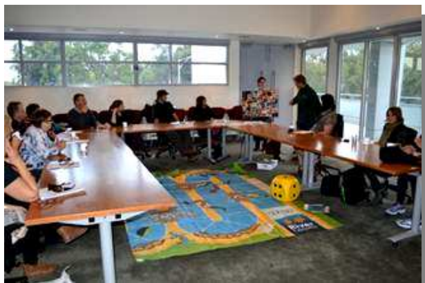
Image 7: Teachers sharing ideas at the Professional Development Training

Presenters were from Goulburn Broken Catchment Management Authority, Greater Shepparton City Council, Parks Victoria, Rumbalara Aboriginal Cooperative, Bentleigh West Primary School and Bug Blitz.