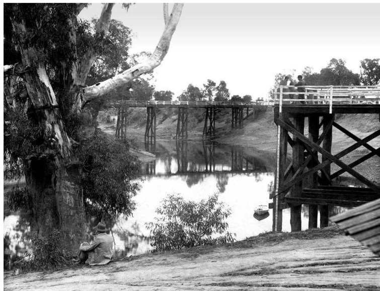
Image 10: Goulburn River showing Fryers Street Bridge and Jetty – circa 1900

RiverConnect staff would like to thank all community and agency members who participated, assisted or provided guidance on any RiverConnect event, activity, meeting or Management Plan.