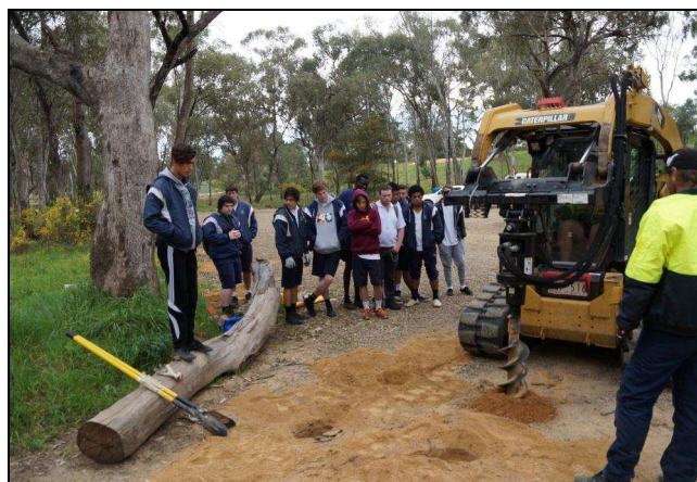
Image 5. Shepparton High VCAL students with Parks Vic crew at Shepparton Weir in September